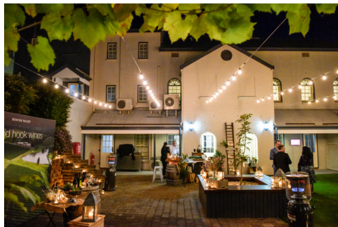
Samuel Marsden Courtyard