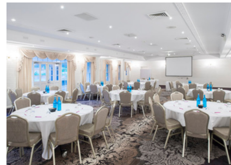
Windsor Room Day Meeting