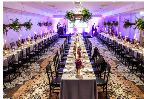
Richmond Room Dinner Party