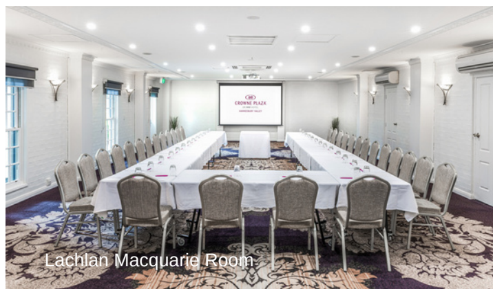
Lachlan Macquarie Room