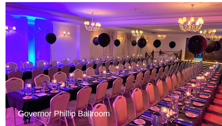
Governor Phillip Ballroom

Flexible, spacious and filled with natural light, our indoor function venues have hosted some of the most memorable social events and celebrations. From 21st birthday parties to bridal showers, christenings and end of year work events, each space can be configured into a variety of layouts and styling options making them ideal for banquet, cocktail and informal functions.