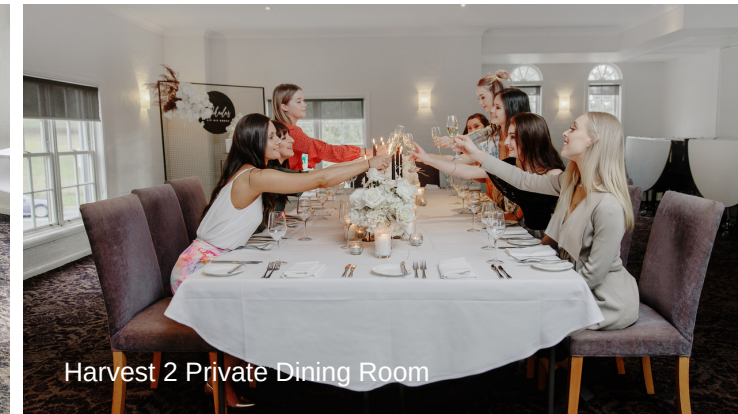
Harvest 2 Private Dining Room