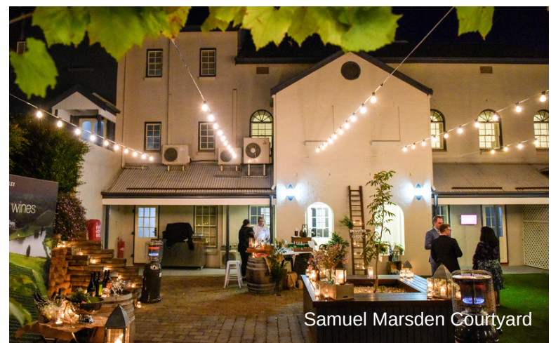
Samuel Marsden Courtyard

Fall in love with our selection of vibrant, relaxing and picture perfect outdoor spaces. Designed for events, we'll help you plan a stunning celebration both you and your guests will love.