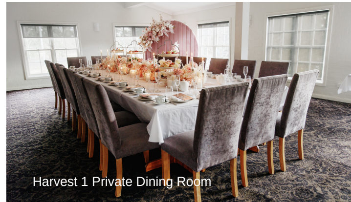
Harvest 1 Private Dining Room