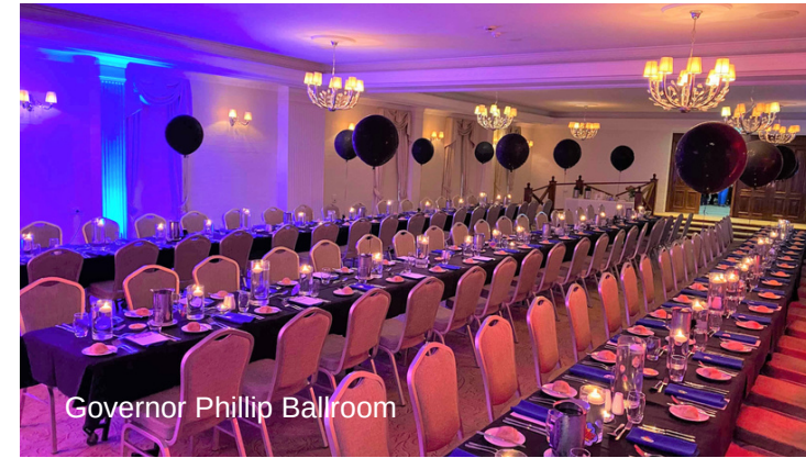
Governor Phillip Ballroom

Flexible, spacious and filled with natural light, our indoor function venues have hosted some of the most memorable social events and celebrations. From 21st birthday parties to bridal showers, christenings and end of year work events, each space can be configured into a variety of layouts and styling options making them ideal for banquet, cocktail and informal functions.