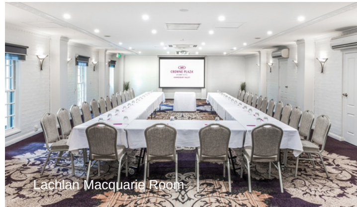
Lachlan Macquarie Room